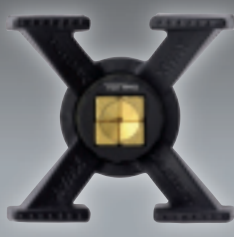
Ref. 72016 XWay